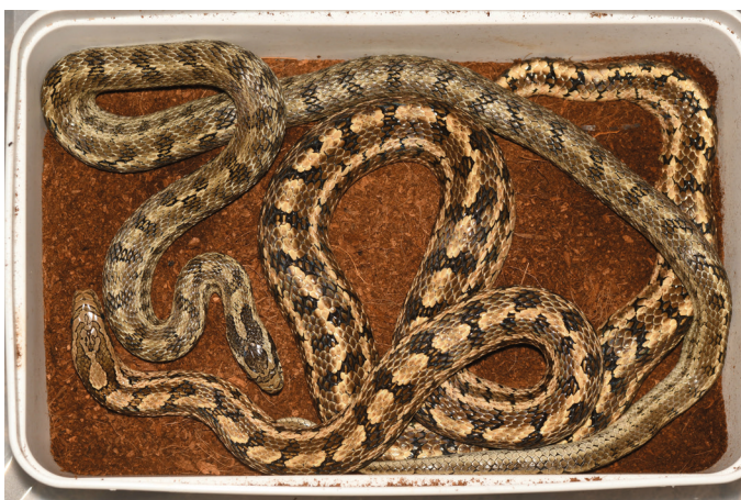
Fig. 1: Sexual dimorphism in the steppe rat snake ( Elaphe diene ), male above, female below

Although many reptiles, including numerous snake species, display clear sexual dimorphism, this is rarely apparent in juvenile animals, as it generally only develops over time. In many species, sexual dimorphism becomes fully expressed only upon reaching sexual maturity (Fig. 1). A prominent example is the anacondas (genus Eunectes ), in which adult females grow many times larger than males. Another example is Wagler's pit viper ( Tropidolaemus wagleri ), in which, in addition to sexual dimorphism, there is also sexual dichromatism—that is, a sex-specific difference in colouration and patterning.