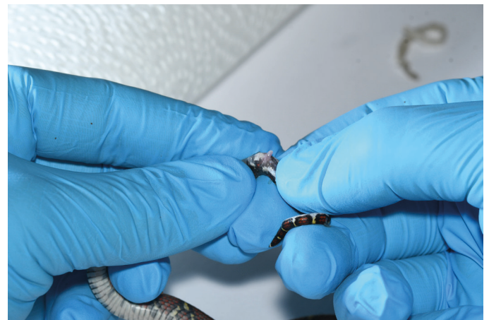
Fig. 2: Everted hemipenis in a juvenile Archelaphe bella

The so-called “popping” technique involves manually everting the hemipenes of male snakes from the hemipenal pockets (Fig. 2). This method has the drawback that it is often applicable only to very young snakes, as the hemipenes of older individuals can no longer be everted. There is also a considerable risk of injury to the spinal region due to tail bending and the application of pressure immediately distal to the cloaca. Furthermore, there is always the risk of misidentification, as males may be incorrectly classified as females if eversion of the hemipenes is unsuccessful.