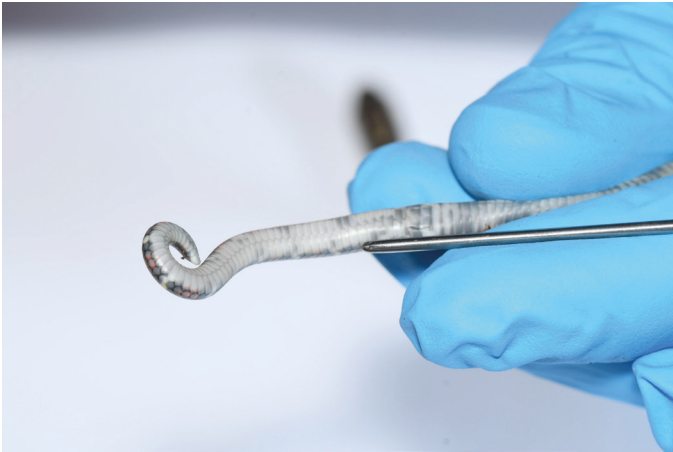
Fig. 3: Hatchlings of many species should not be probed due to the high risk of injury