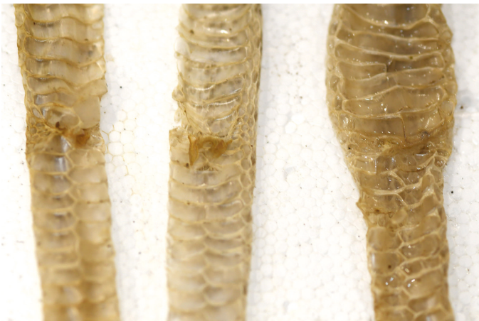
Fig. 4: Hemipenial pockets can sometimes be observed on the dorsal scales of adult colubrids

Certain characteristics can indicate a snake's sex without further manipulation. These include, for example, tail shape or visible sexual traits, such as hemipenial pockets on the dorsal scales of colubrids (Fig. 4). However, these methods require considerable experience, are highly unreliable, and should be applied with great caution.